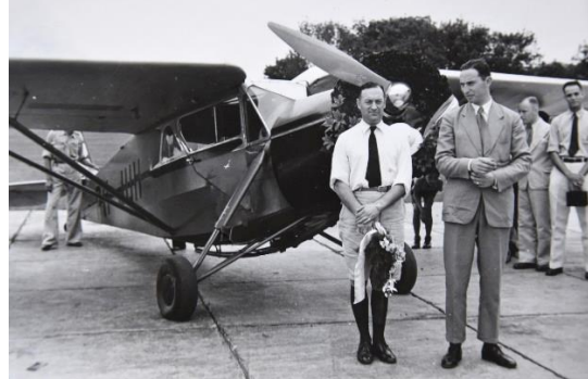
...and after arriving at the airfield Tsjillitan in Batavia on 8 November 1936. After a flight of more than 13.500 kilometres the plane and pilots were honoured [8].