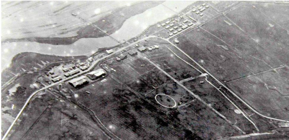
Airfield Orfordness before the Second World War

From 1924, this airfield was a satellite station for the Airplane and Armament Experimental Establishment which was based at Martlesham Heath. Because of its remoteness, the area was very suitable for ballistic tests with bombs. From 1935, a small experimental radar unit was active on the airfield [12]